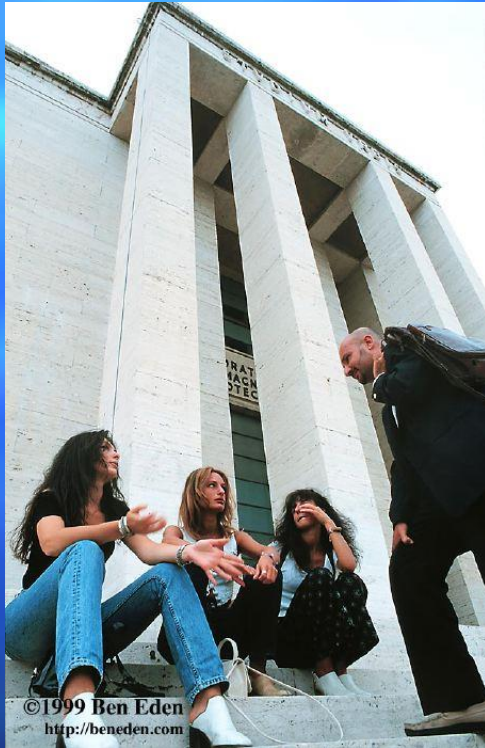
La Sapienza, Rome