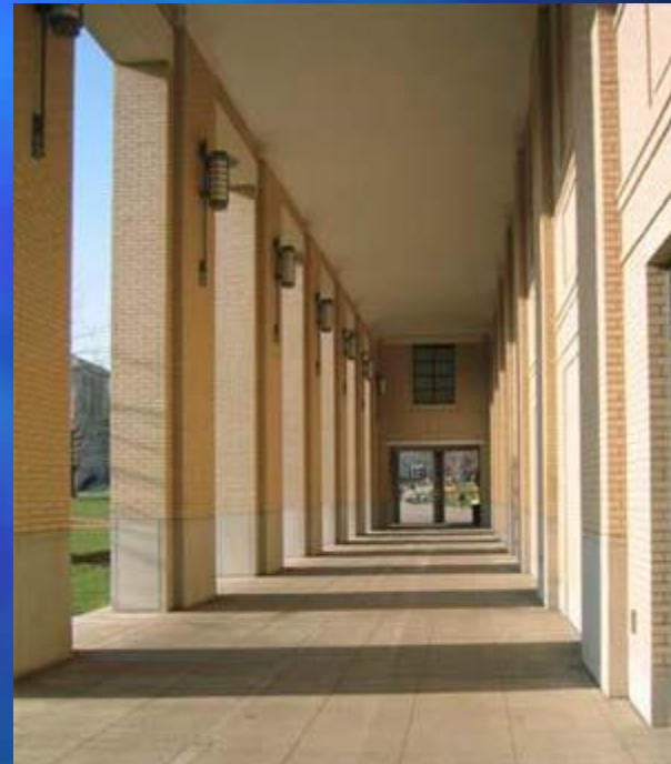
CMU Student Center, Pittsburgh