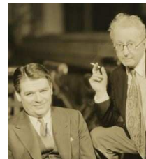
Hammerstein and Kern