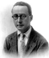
Kern at age 33