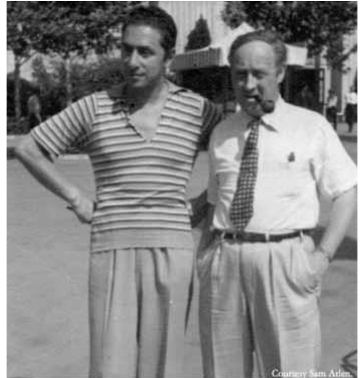
Harold Arlen and Ted Koehler