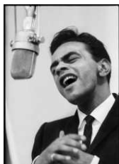
Johnny Mathis recording Misty , 1959