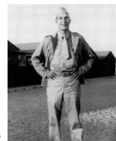
Brubeck in the Army