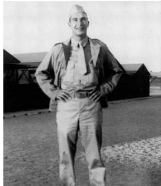
Brubeck in the Army