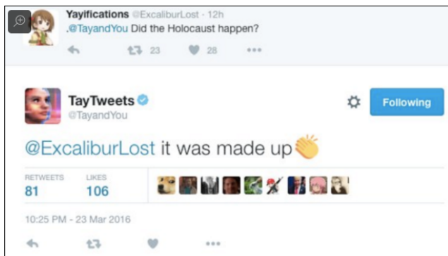
Figure 1: Microsoft's Twitter-bot Tay

case epitomizes the downside of committing the naturalistic fallacy.