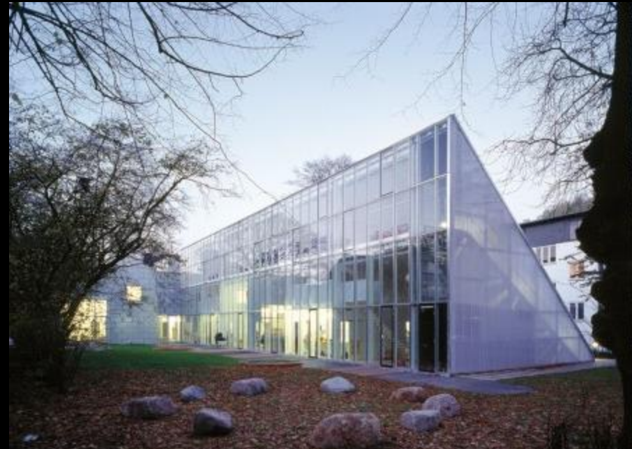
Day care center, Copenhagen