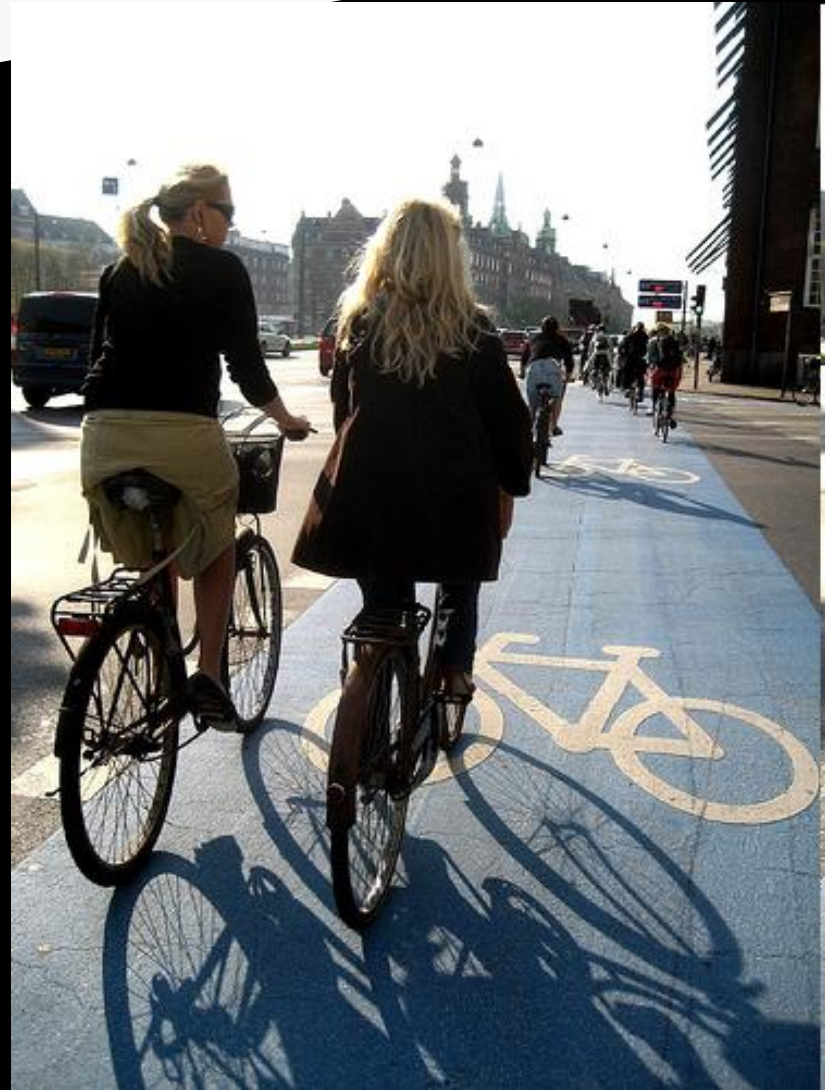
First rate cycling infrastructure