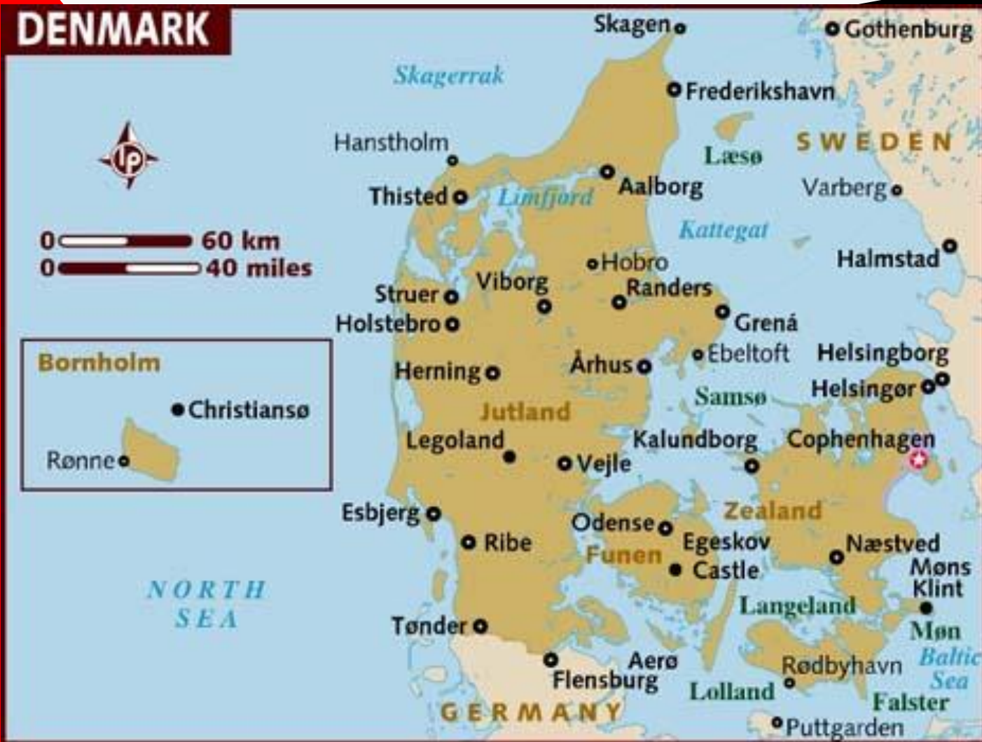
Map of Denmark