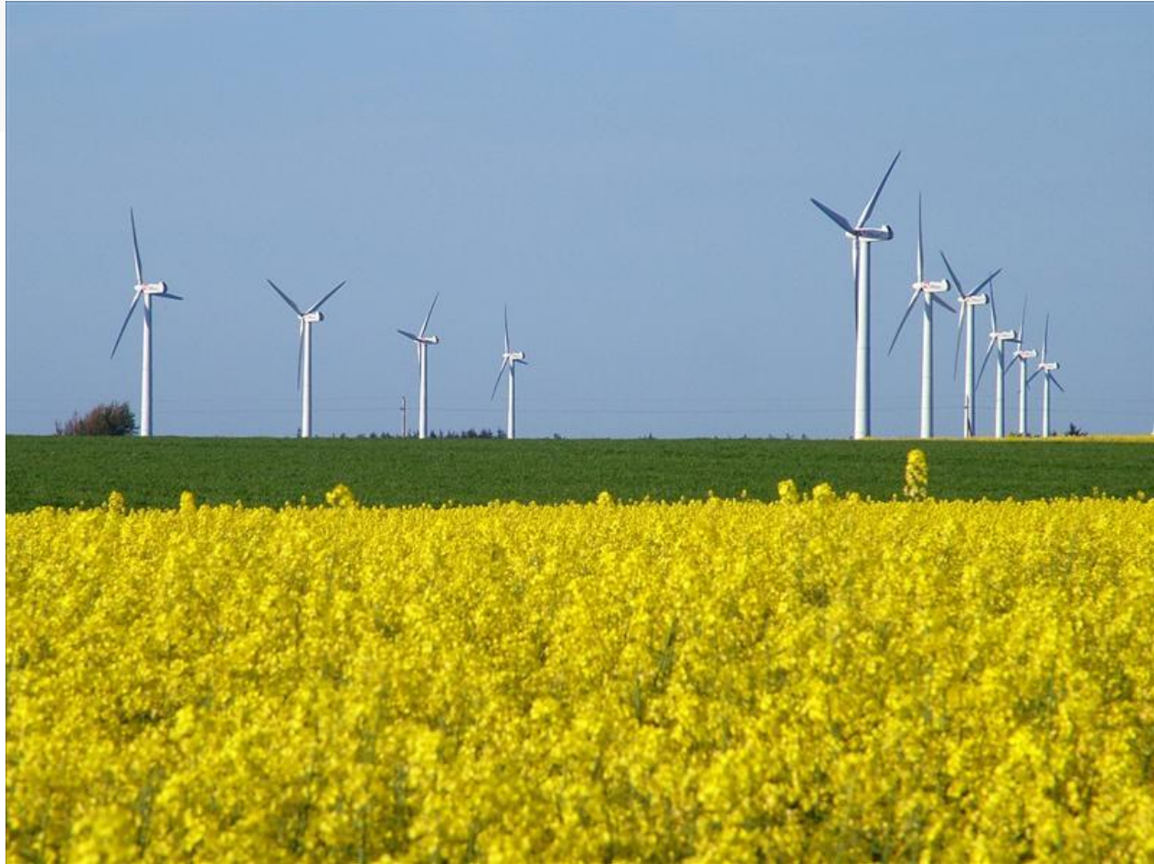
Jylland landscape with wind farm