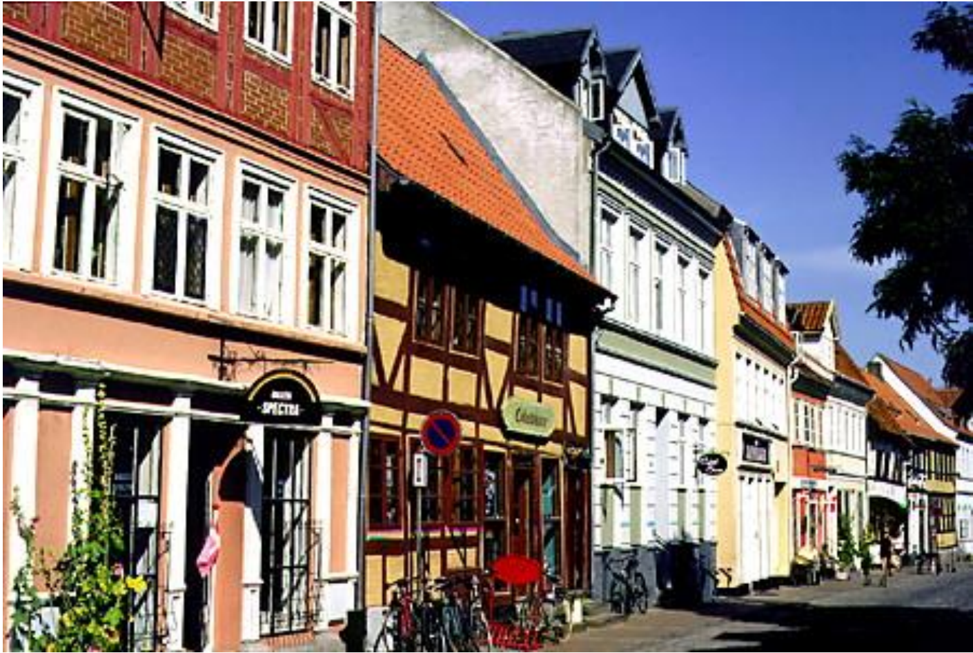
Odense, hometown of Hans Christian Andersen