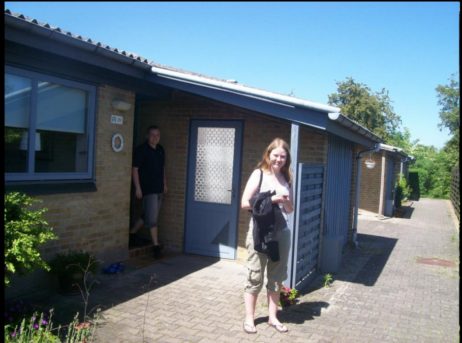
Typical Danish home