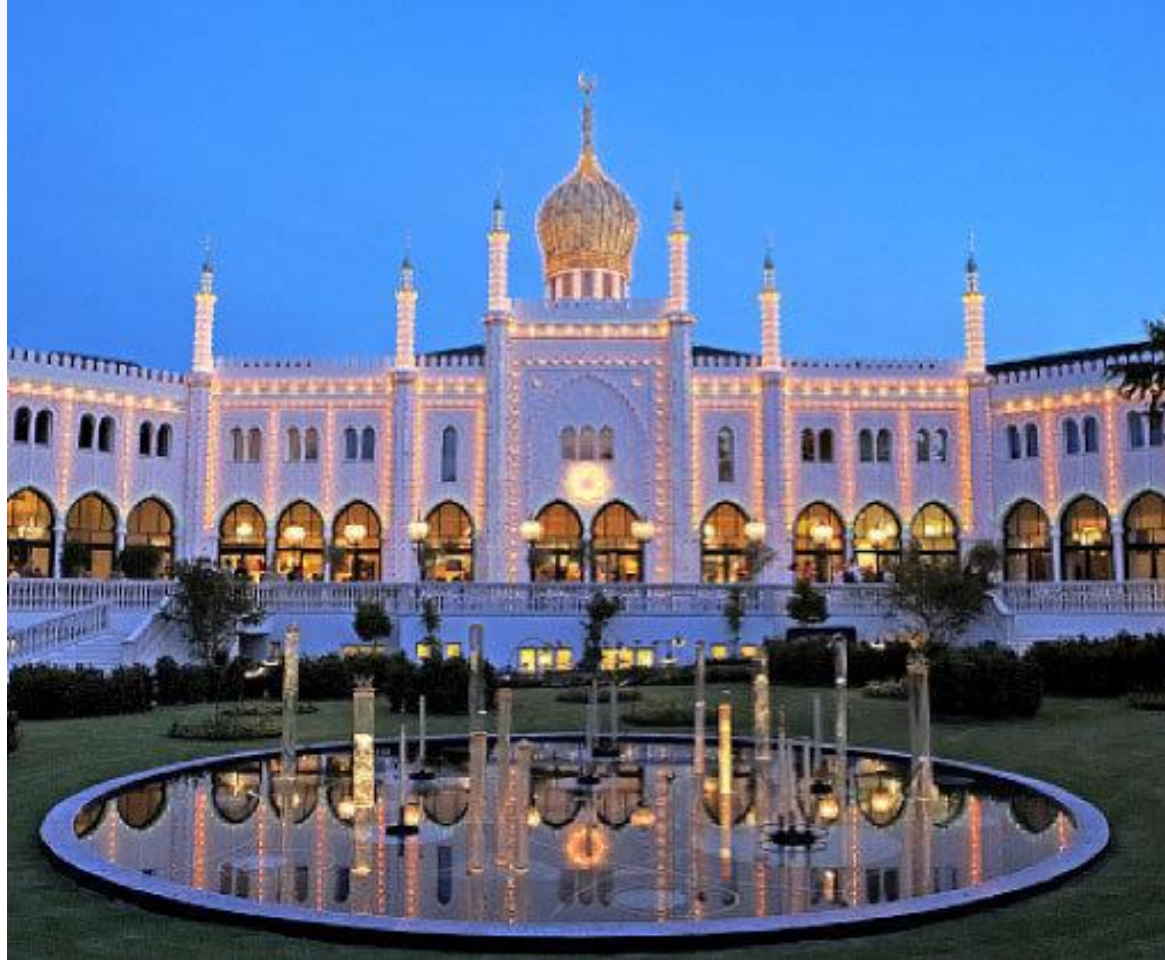
Part of Tivoli Gardens, København