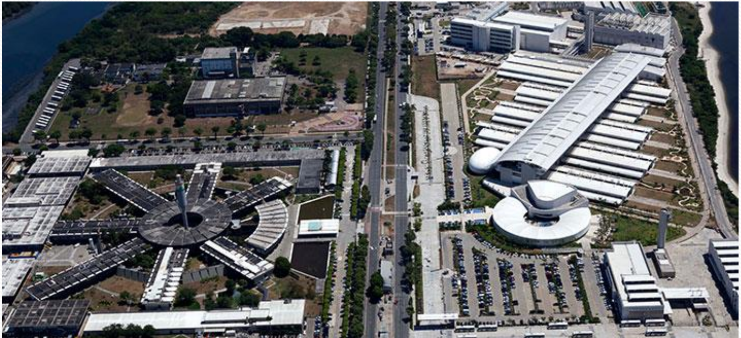
Petrobras Cenpes Research Center, near Rio de Janeiro Facility on right opened in 2010. Brazil is also strong in pharmaceuticals