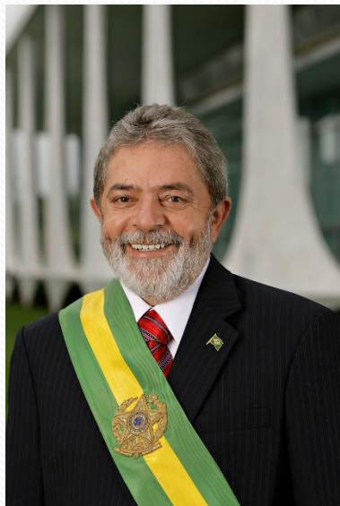
Luiz Inácio Lula da Silva President, 2003-2011 Portuguese