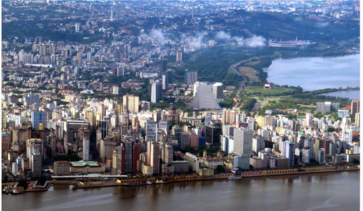
Porto Alegre, largest city in the region.