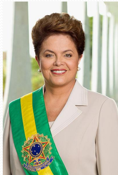
Dilma Rousseff President, 2011-2016 Bulgarian