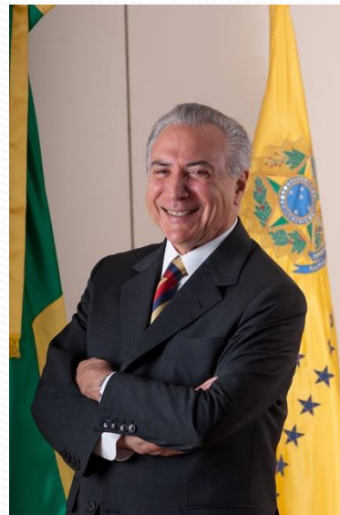
Michel Temer President, 2016-2019 Lebanese